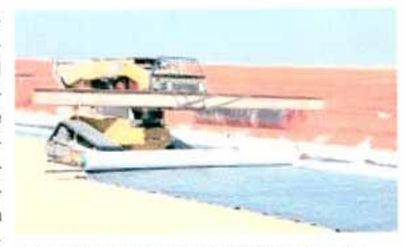
Photo 3. The demand for higher waste heaps continues to fuel liner system design innovation.

the weakest interface between any of the components, including within the GCL, if lacking internal shear reinforcement. Interface shear testing of GCLs under large normal stress conditions representative of landfill liners can drive internal failure of the GCL if it does not possess adequate strength. This internal failure phenomenon was observed during the qualification testing of a particular GCL under consideration for this project. For this reason, interface shear testing is always recommended during the design phase of a project, especially when high normal and shear loads are expected.