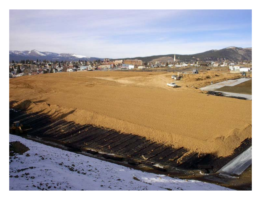
Photo 2. Apache Tailings depositional area cap looking north with town of Leadville in background.

In the multi-layer cover system, a double-nonwoven needlepunched GCL was used on the slopes (which varied from 3H:1V to 5H:1V) and a woven-nonwoven needlepunched GCL was used on the top deck where the need for higher interface friction was not warranted. A triplanar drainage geocomposite was chosen for the drainage layer. The seeded soil cover is currently protected with a single-sided biodegradable-straw erosion control blanket. A GCL was also used to line the surface water run-off and run-on control structures.