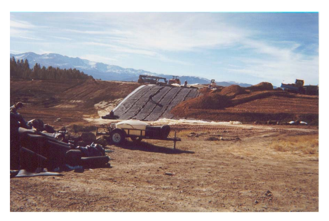
Photo 1. Needlepunched GCL being installed over regraded tailings at Apache Tailings Impoundment of California Gulch Superfund site.

In field pan tests a needlepunched GCL was subjected to a winter of freeze-thaw cycling in south central Wisconsin. Three needlepunched GCL specimens were tested, two with a seam and one without a seam. The leakage was measured prior to winter and in the spring. The hydraulic conductivity measurements showed no increase in hydraulic conductivity from the winter of freeze-thaw cycling. Overall, the results of the laboratory and field tests on the GCLs that were tested showed that freeze-thaw cycling did not adversely affect the hydraulic performance of GCLs.