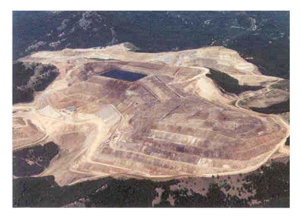
Photo 3. Landusky Mine with the L87/91 leach pads in the foreground and the Surprise Pit and other pits in the background.

The Zortman Landusky Suprise Pit cap project in located in Landusky, Montana. From 1979 through 1998, Pegasus Gold Corporation and its wholly owned subsidiary company, Zortman Mining Inc. (ZMI) operated the Zortman and Landusky mines in the Little Rocky Mountains in northcentral Montana. While historic mining activity had occurred in the area since the mid-1860s, the advent of cyanide heap leach technology, combined with a sharp rise in gold prices, prompted the development of these two large-scale, open pit mining operations beginning in the late 1979. A 1992 review of water resources monitoring information by the Montana Department of Environmental Quality (MTDEQ) showed that acid rock drainage was a widespread occurrence at both the Zortman and Landusky Mines. The MTDEQ requested that ZMI propose corrective measures to their existing reclamation plans. In March 1998 ZMI and its parent company, Pegasus Gold Corporation, announced that were going to reclaim and close the mines.