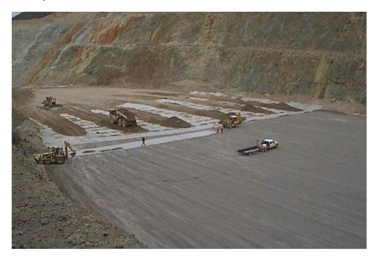
Photo 4. Installation of laminated GCL at the Landusky mine Suprise Pit.

Billings, Montana. Additional clean waste material was imported into the pit and the bottom was graded to a relatively flat 3% slope and a two-inch layer of bentonite was spread over the waste and compacted. The bentonite layer was then overlaid with a membrane-laminated unreinforced GCL (Photo 3). The GCL, laminated with a thin polyethylene membrane, was used because infiltration needed to be minimized, even if the pit pooled with several feet of water during snowmelt. Small piles of cover soil were placed intermittently on the GCL panels to prevent movement from high winds until placement of the full final cover. The use of a GCL allowed for quick installation and approximately 20,000 square meters (220,000 square feet) of material were installed in three days in November 2001.