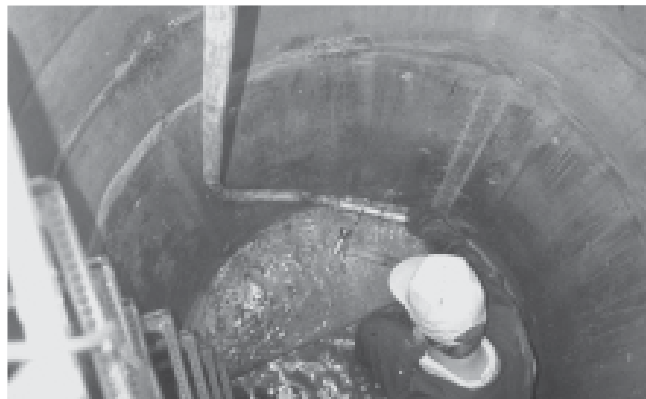
INTERIOR THROUGH WALL APPLICATION: BENTOGROUT injected to the exterior of a manhole through pre-drilled holes using a short injection wand