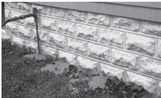
EXTERIOR MASONRY WALL APPLICATION: Inject BENTOGROUT along the exterior of a foundation wall at 600 mm on centre intervals