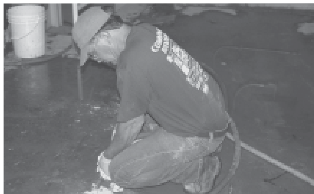
STRUCTURAL SLAB APPLICATION: Inject BENTOGROUT under an existing slab to provide waterproofing and fill void areas