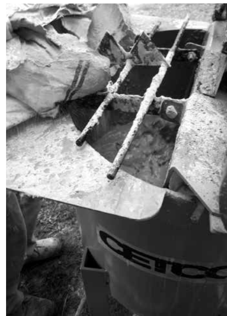
Mixing BENTOGROUT in CETCO mixer

Limitations: BENTOGROUT is not designed to bridge cracks or gaps larger than 3 mm. Interior surface cracks greater than 3 mm should be surface sealed with cement based patching material to prevent grout extrusion into the structure. BENTOGROUT is not designed as a structural patch. BENTOGROUT is not recommended for above ground or applications that do not provide proper confinement. BENTOGROUT is not suitable for sealing expansion joints.