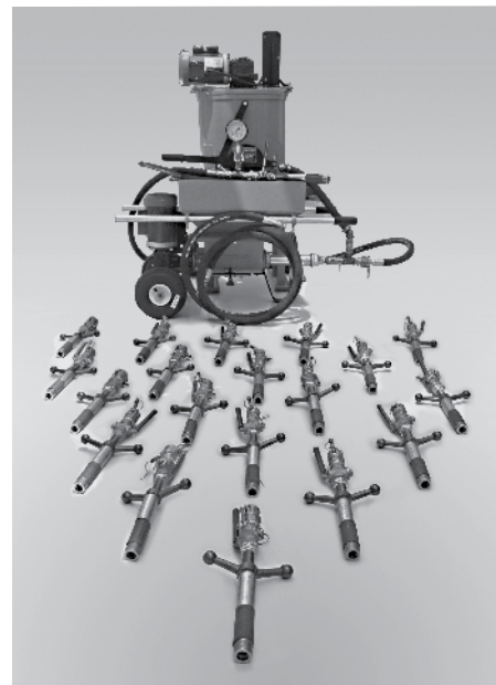
CETCO BENTOGROUT Pump, Mixer and Accessories

Caution: Pumping any material under pressure can cause lifting or movement of adjacent structures.