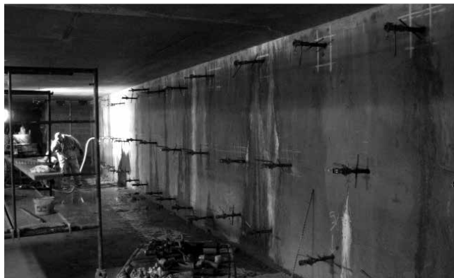
INTERIOR SURFACE GROUT INJECTION: BENTOGROUT is applied to the inside of the building without excavating the site