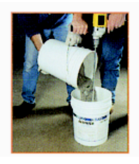
Add powder, mix to desired consistency.