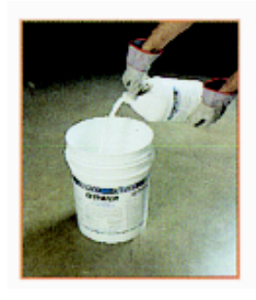
Pour premeasured mixing liquid into pall.