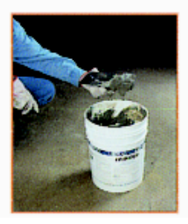
Material is ready to apply.