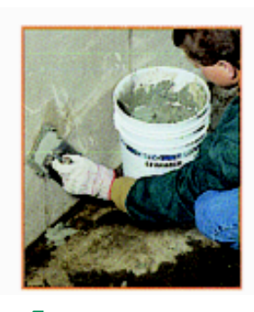
Apply material to repair area.